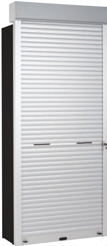
Shown without optional side closure panel