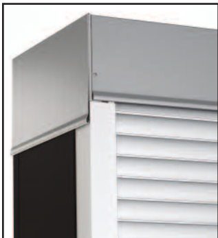
Optional Side Closure Panels add the finishing touch (aluminum door only) UPC No. 07668