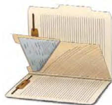
Slash Jacket Dividers

When you can't punch important documents, choose from the following options: